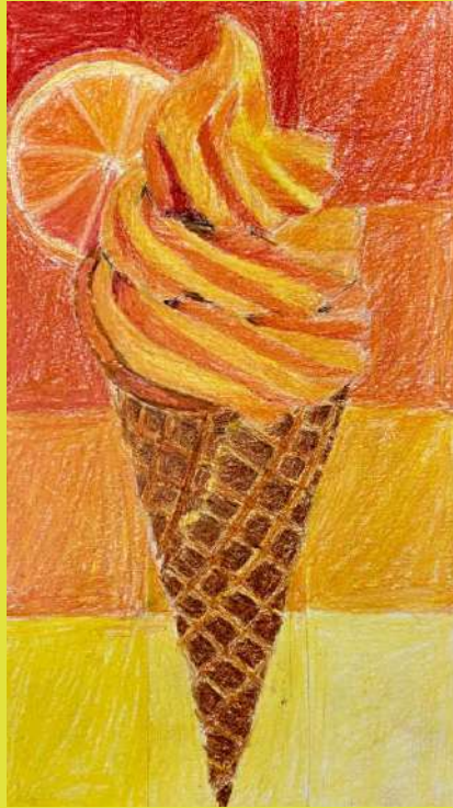
14. Iakovos Antoniou