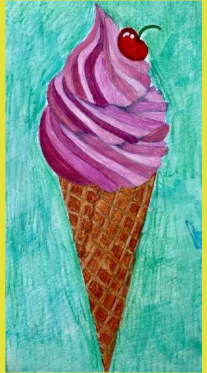
9. Irene Fouli