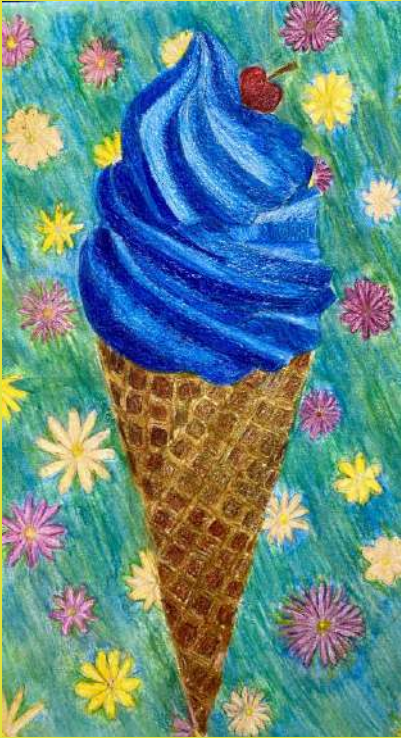
7. Leda Triandafillou