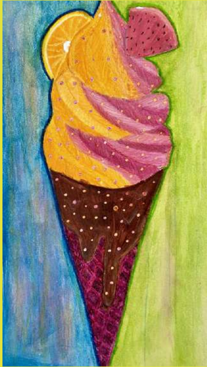
32. Penny Theophilides