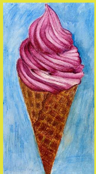
18. Artemis Stylianou