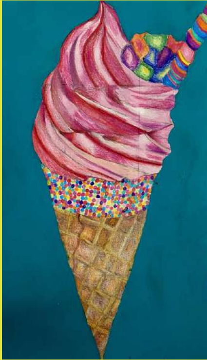
8. Dafni Ioannou