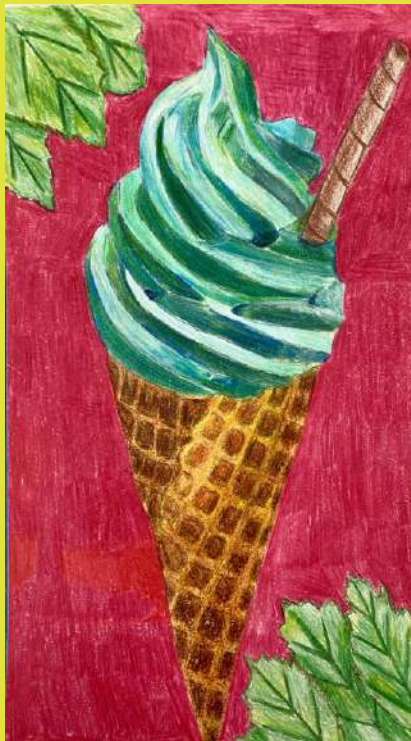
4. Leda Liveri