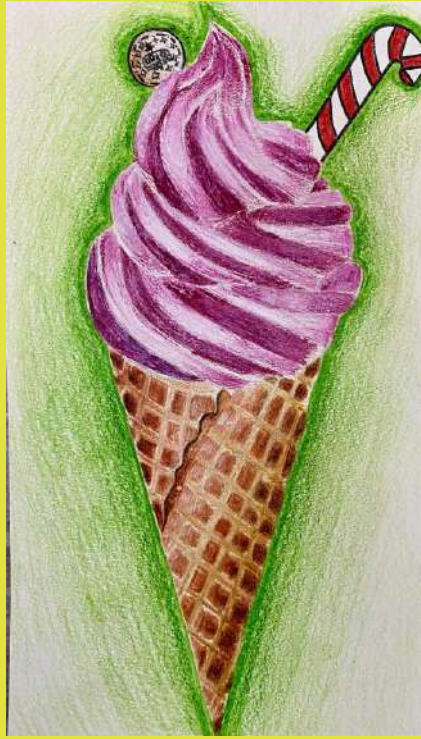
20. Theodosia Nicolaidis