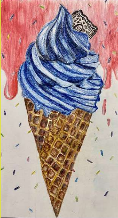
13. Nefeli Demetriades