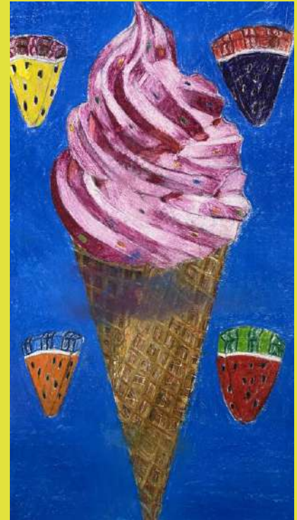
36. Chryso Antoniou