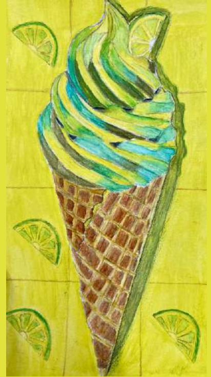
15. Elena Potamiti