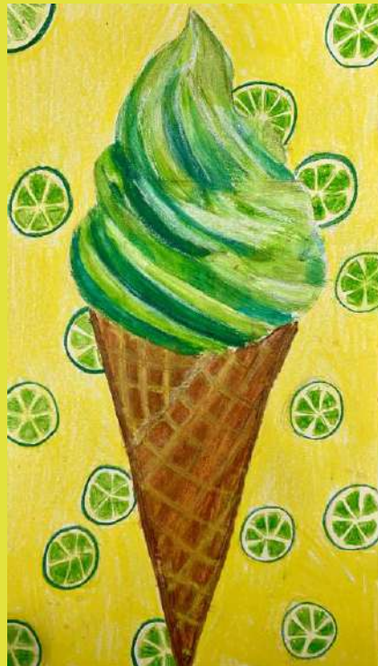
5. Alya Kivanchli