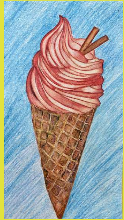
27. Natalia Hadjisavva