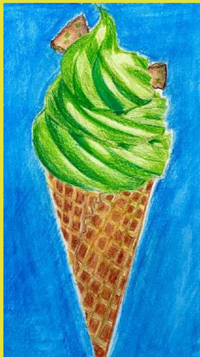
17. Panayiotis Charilaou