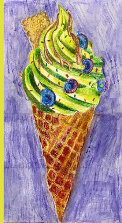
21. Platon Trapelides