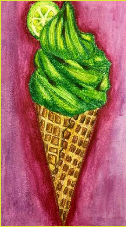
1. Anastasia Zannoupa