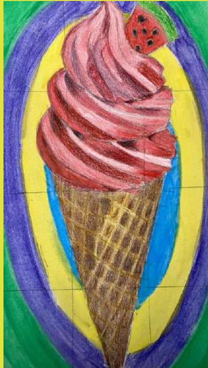
35. Zoe Kilianiotou