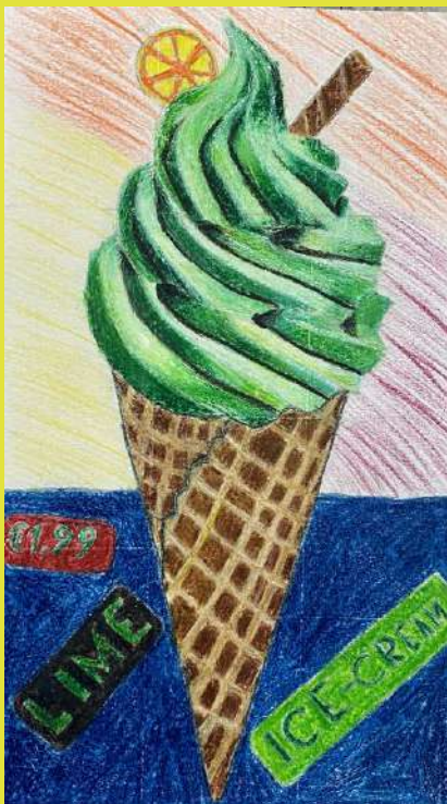
22. Lambros Skourides