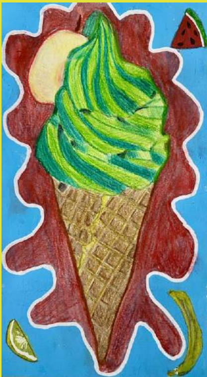
10. Christos Papaioakim