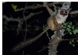
a bush baby