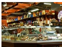
A delicatessen: a shop selling cooked meats, cheeses, and unusual or foreign prepared foods

Eleven thirty? That couldn't be right. Mum always woke him early at weekends, even during the summer holidays. Tom's parents, Jonas and Sophie Harding, owned a delicatessen and coffee shop, and he had to be up before they opened at half past eight.